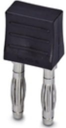
Short-circuit connector, pitch: 10 mm, number of positions: 2, color: black

Please be informed that the data shown in this PDF Document is generated from our Online Catalog. Please find the complete data in the user's documentation. Our General Terms of Use for Downloads are valid ( http://phoenixcontact.com/download )